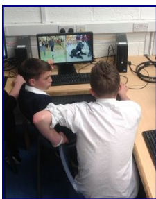
Photo shows students peer learning & using ICT to prepare for their oral presentations.