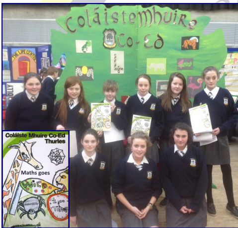
Photo shows 1 st year students attending the Make a Book Exhibition in Cork City Hall where they presented this year's publication "Maths Goes Wild".