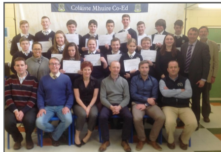
Photo shows 5 th year students displaying their certificates with Dew Valley Foods personnel and Coláiste Mhuire Co-Ed staff members.